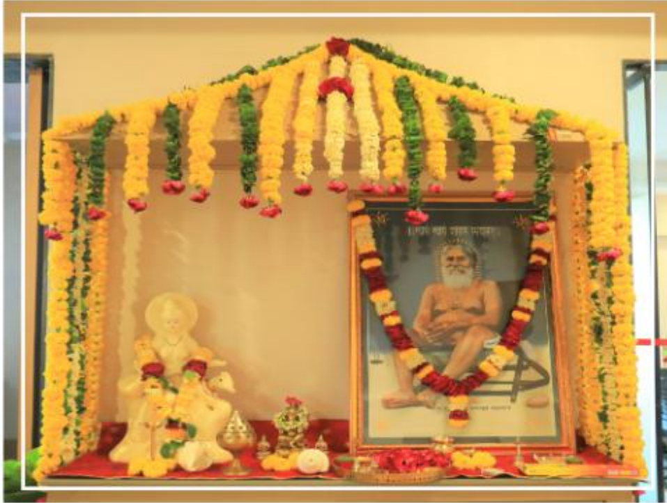
Goddess of Knowledge Maa Saraswati