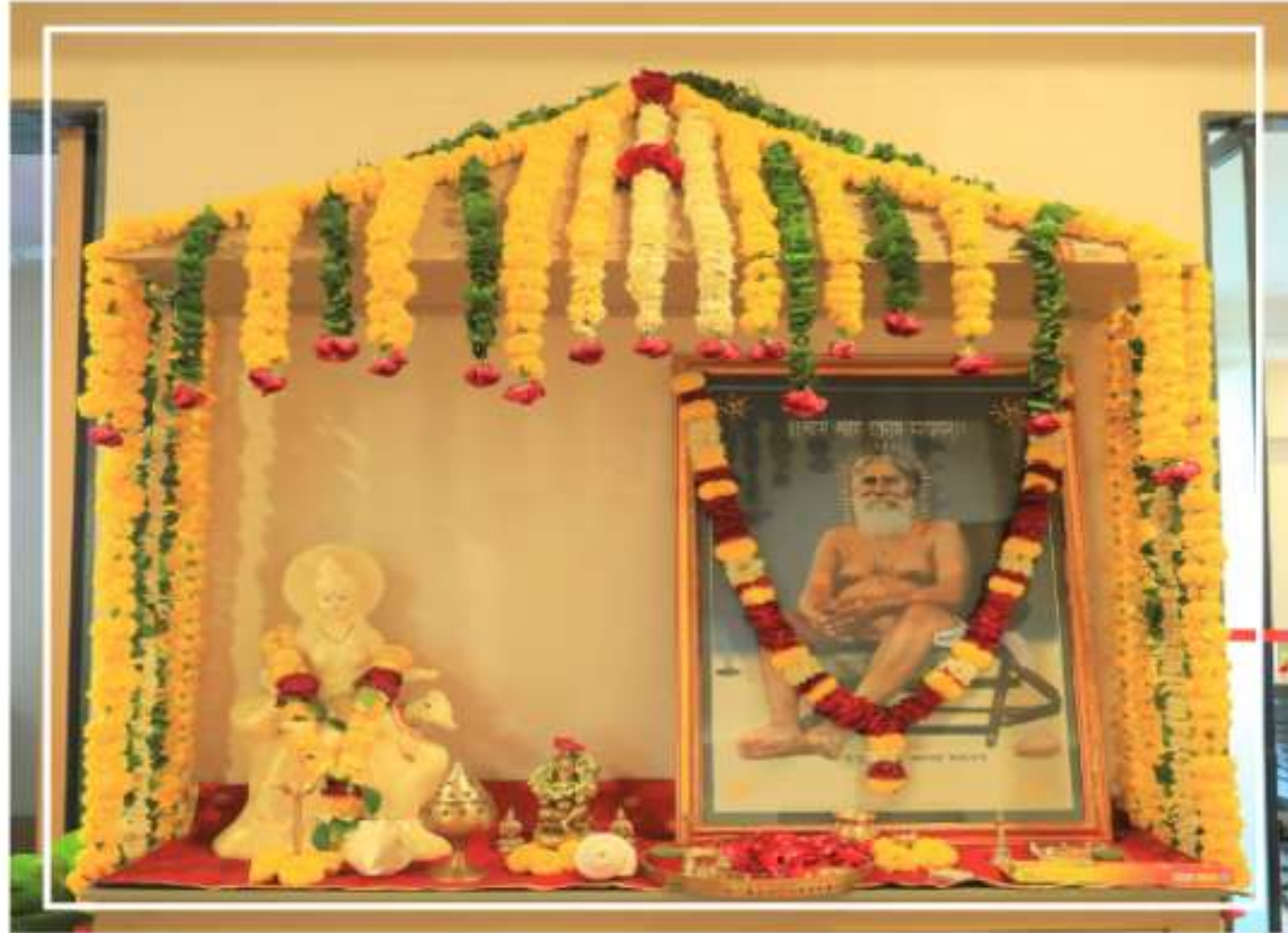
Goddess of Knowledge Maa Saraswati